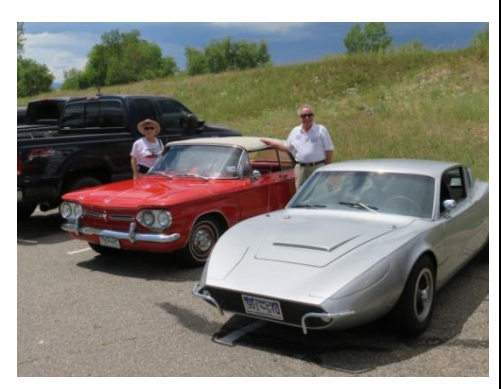
RMC Corvairs at the Cherry Creek State Park picnic