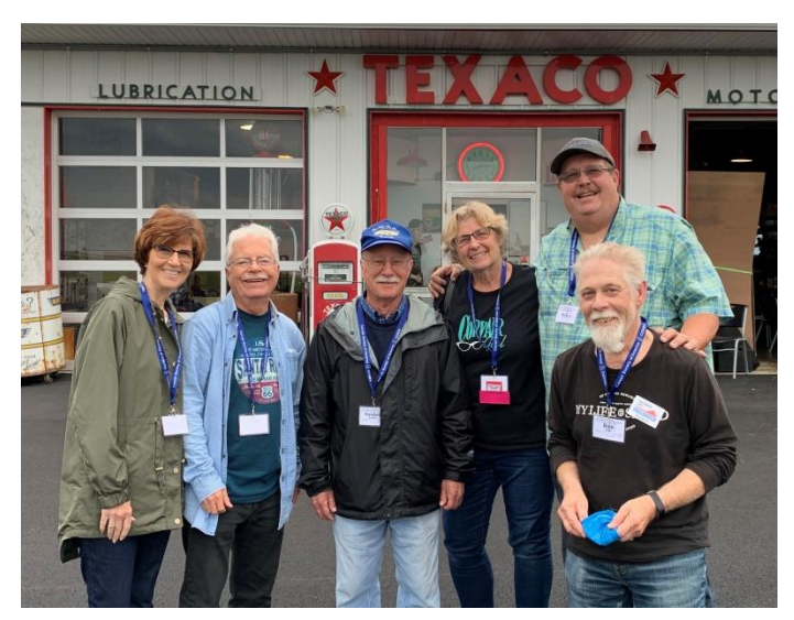
The RMC/PPCC CORSA Mini crew

Once we got SeeMore and ourselves settled in, we headed over to a welcome event at the new Corvair Museum.there were Corvairs hot dogs, hamburgers and live music.