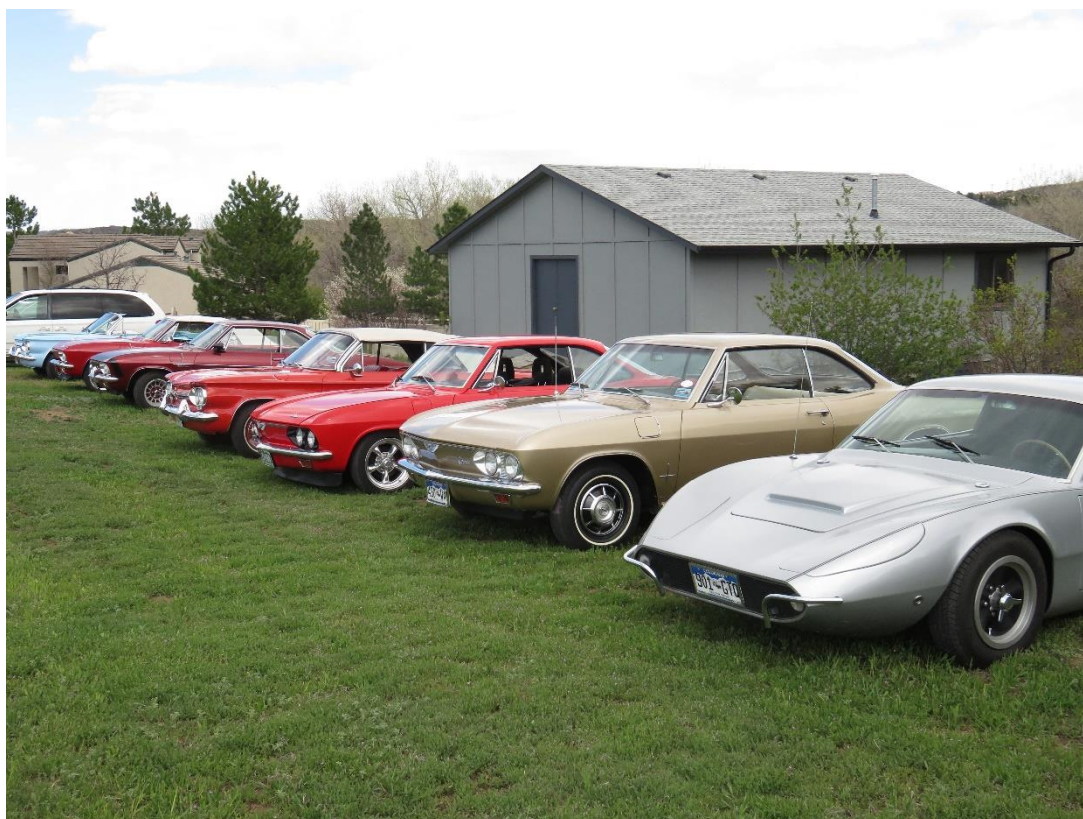
RMC Corvairs at the 2019 Tune-Up

Official Publication of the Rocky Mountain Corsa Corvair Club