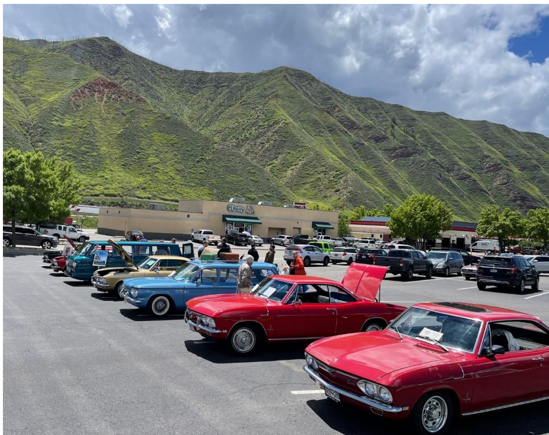
The 2022 Tri-State Corvair meet Show and Shine in Glenwood Springs

Official Publication of the Rocky Mountain Corsa Corvair Club