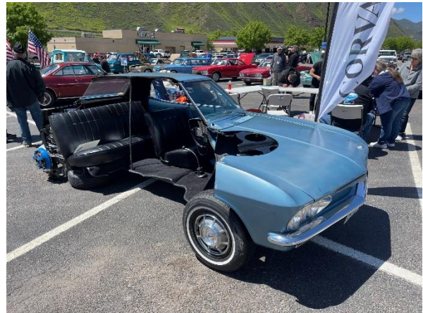
Seemore gets around