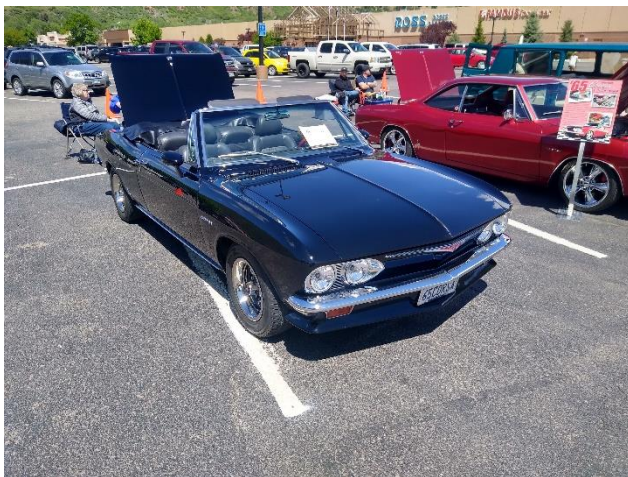
Don Young's Corsa Convertible