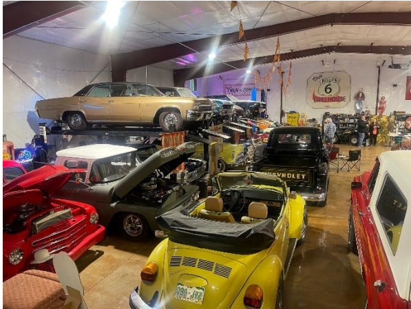
Bart Victor's garage