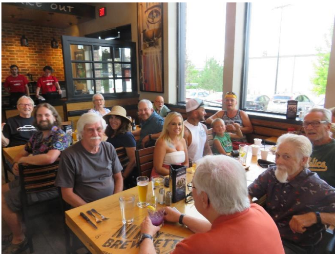
Our crew waiting for dinner