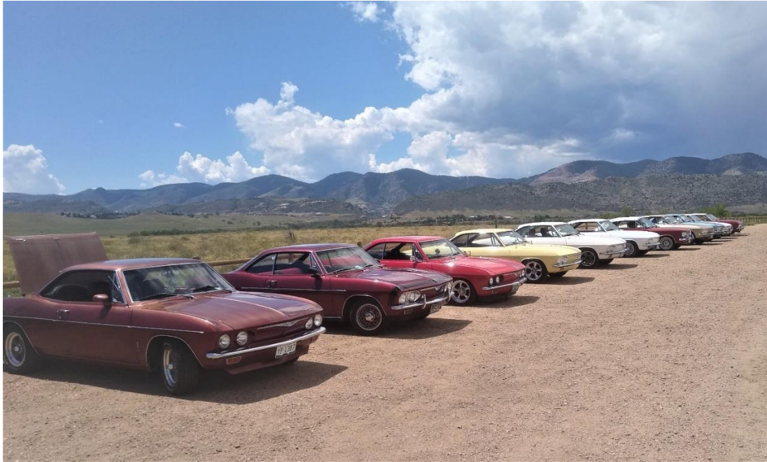
RMC Corvairs lined up at the 2022 Dale and Joan Wilshire Memorial picnic

Official Publication of the Rocky Mountain Corsa Corvair Club