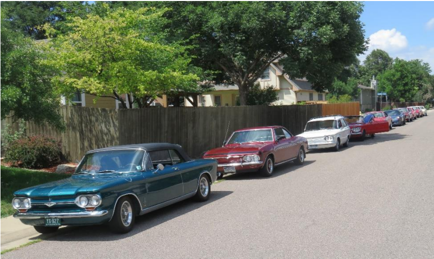
RMC cars lined up waiting for the Drive-by